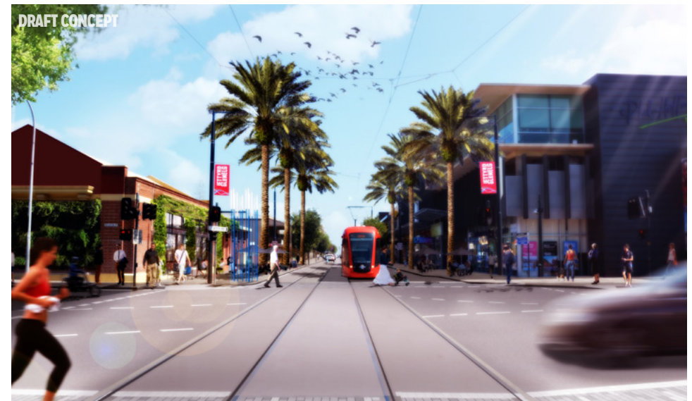
Vision for Brighton Road Gateway