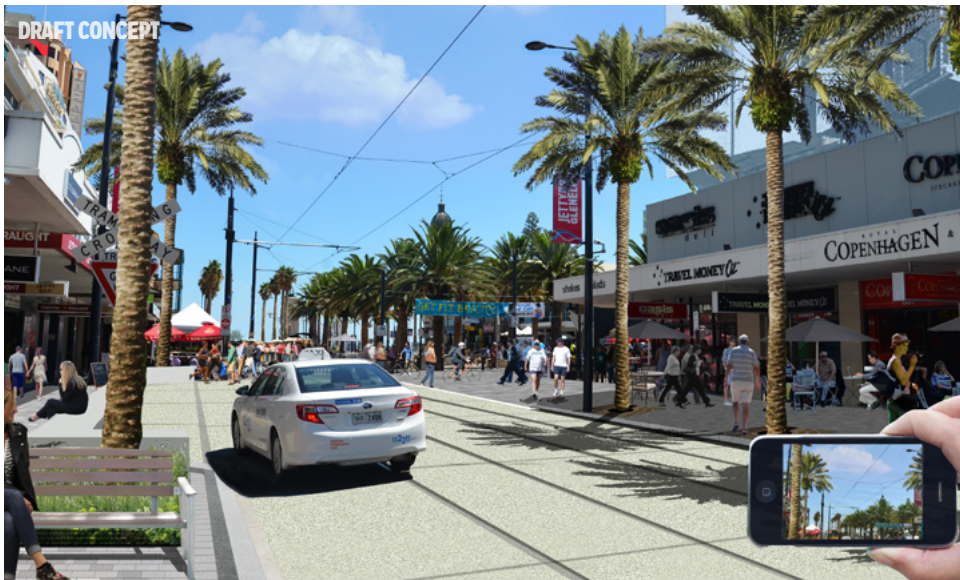
Vision for integration of Jetty Road into Moseley Square